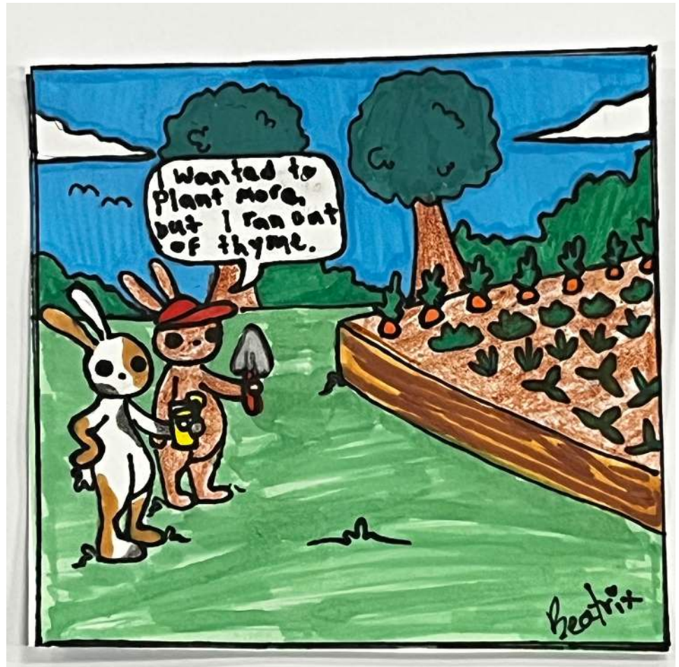
Welcome Spring! Comic by Beatrix

FIFA World Cup 2026 (June 11–July 19, 2026):