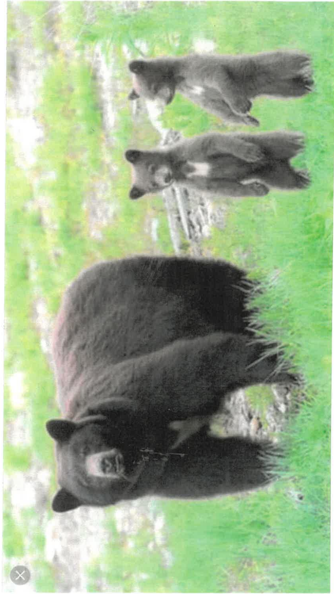
4. Tleh (cleh) black bear

Arms out, "clawing" trees, digging in the brush