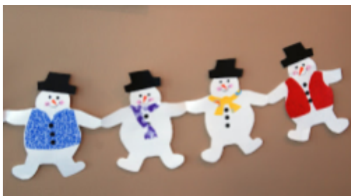
Quatre bonhomme de neige

Inspiration et images viennent de Auntie Annie's Crafts: https://www.auntannie.com/Valentines/PaperHeartChain/