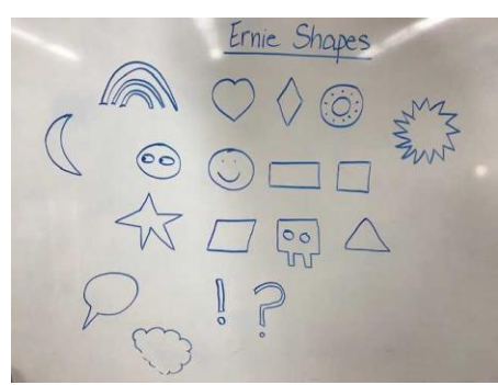
Co-create ideas for simple shapes

Performance of understanding: Students combine their efforts with those of others to effectively accomplish a drawing task.