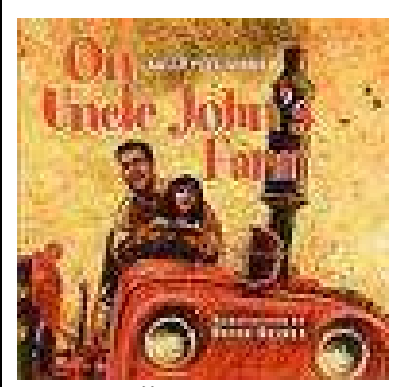
by Sally Fitz-Gibbon