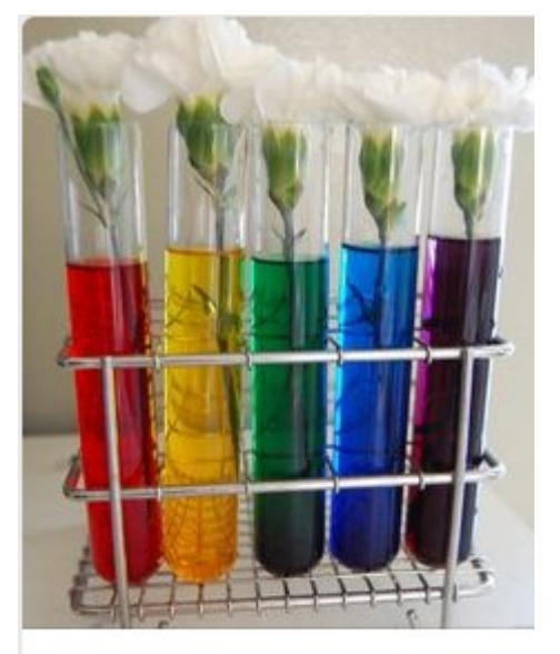
Color changing flowers - amazingly fun Science for kids!