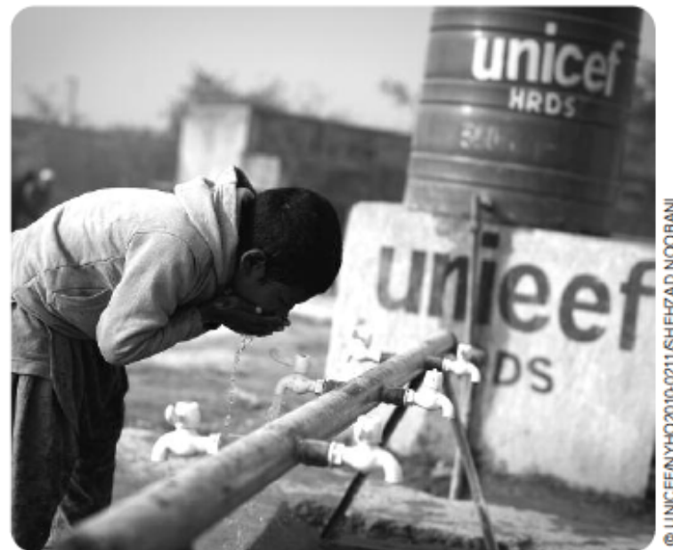
B. A boy washes his face at a UNICEF-supported water source, in a camp for people displaced by the floods in Pakistan in 2010. Millions of people were affected by the floods, and when they returned to their homes they had to deal with high water levels and washed-out roads and bridges.

Rights, needs or wants that appear to be protected: